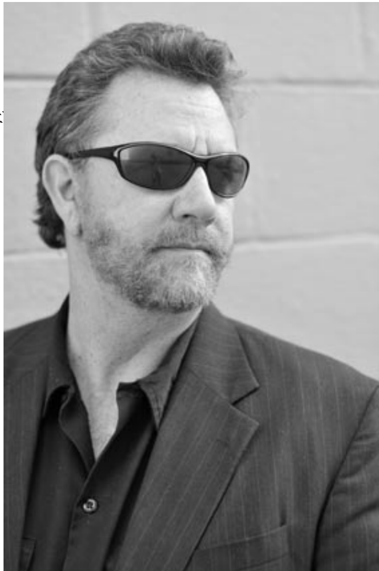
Special to Magic City Blues News

At 18 and just out of high school, music was still a far off dream that only happened to others, so he hired on with the railroad traveling the Midwest with a 90-man rail gang living in camp-cars. He learned about life fast and hard once outside his small town.