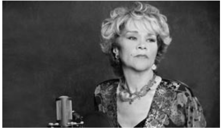
Special to Magic City Blues News

After her success in the 1960's James' life took a downturn as her drug addiction took hold. She fought the habit for decades and had to climb back into the spotlight in the 1980's after so many years off and some damage to her voice. She did manage to kick the habit and made several notable blues albums in that